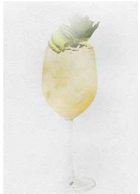
GARDEN FIZZ $160

A glass of bubbles will surely freshen up your cocktail drinks