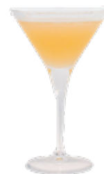
HONG KONG GIN SOUR $108 Two Moons Gin, Honey, Lemon Two Moons 氹酒, 蜜糖, 檸檬

Prices are in HK Dollars and subject to 10% service charge 所有價格以港幣計算及另收加一服務費