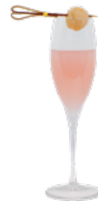
LYCHEE ROSA $120 Prosecco, Lychee, Rosé 普賽克, 荔枝, 玫瑰